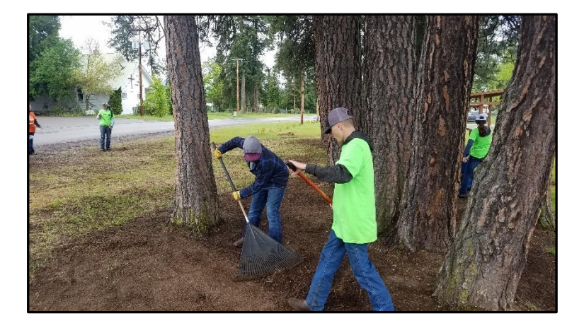
Beautification week was a success!!